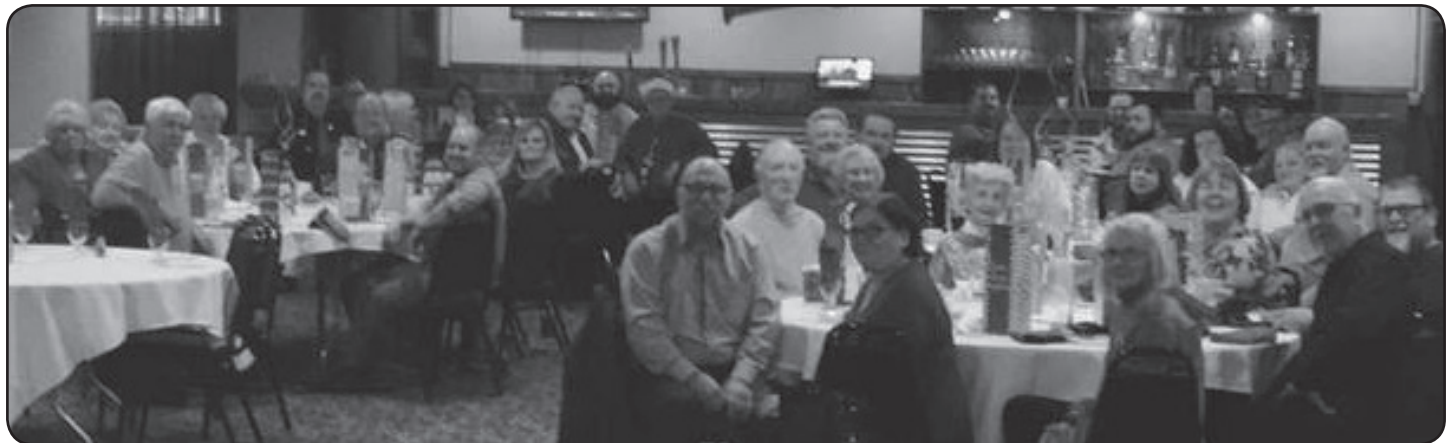
Askam Lodge #899 holds annual Christmas dinner, lodge brothers & their spouses get together to enjoy a dinner together

Askam Lodge #899 brothers generously donate trunk full of Christmas presents, pajama sets and board games to local elderly nursing home patients, and also local underprivileged children.