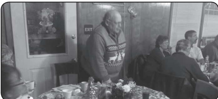
Sandy Lake Lodge #573 held a Christmas "Party" for several Lodges Thursday Eve, Dec 13, 2018 at McCulloughs Restaurant. 50 were in attendance. Great Meals were served and business transacted. $1000.00 presented for the "Back Pack" program in the local Schools so kids will have Meals for Dinner/Supper time. A Trio of local gentleman, S.L.I.M. Bros., Serving the Lord In Music entertained with Christmas Songs and Audience singalong. Door prizes given. A GREAT evening was had by all.