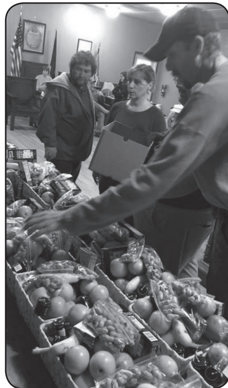
Mt. Hor Odd fellows #736 of Cassville Christmas party and making baskets for the less fortunate.