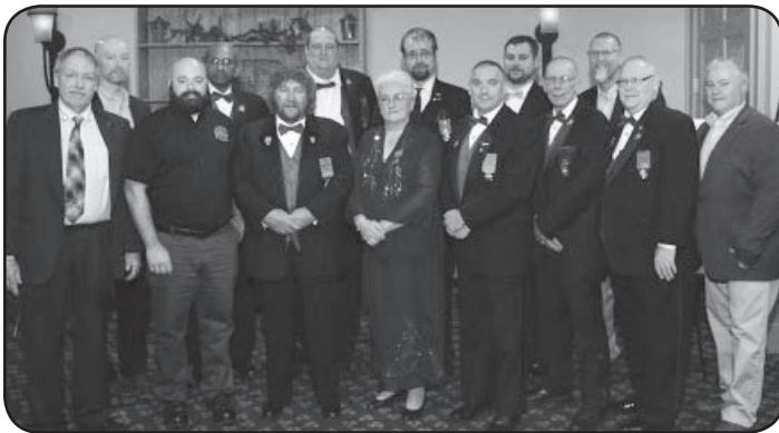
State Officers and Freedom Lodge Officers