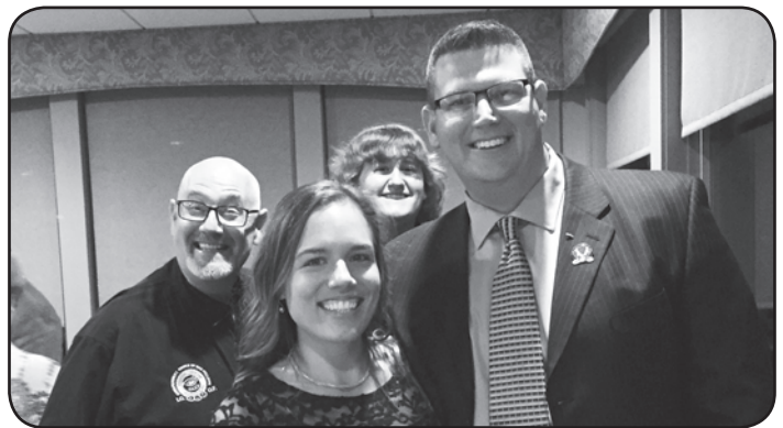
Families, Members and Friends