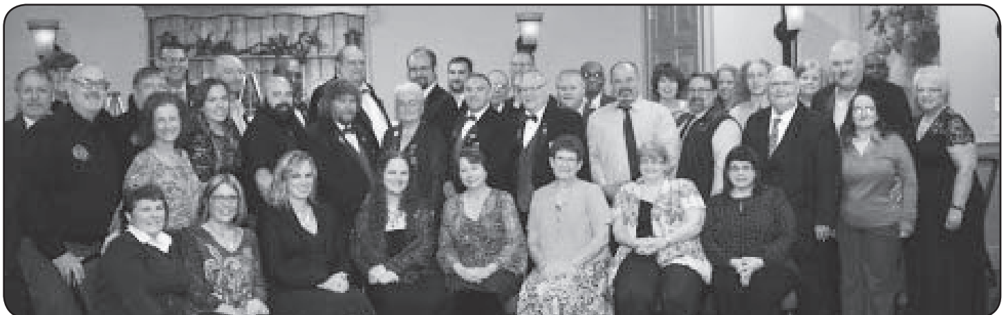
Members and families