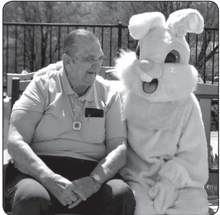
The Easter Bunny came to visit us here, the residents and kids had a great time getting their photos taken!

Algernon Charles Swinburne said it best: “Blossom by blossom the spring begins!” Here at The Middletown Home, we have seen spring blooming in each flower one by one until before we knew it, we had a beautiful burst of spring right outside our door! This month has been full of springtime fun. From Easter Egg Hunts, to decorating eggs, to Spring Fling Parties! Our residents spent a whole afternoon filling eggs for our annual Easter Egg Hunt. We had over 300 eggs hidden around the home for the kids to find. This year we had a special visit from the Easter Bunny. The gorgeous spring day was a perfect backdrop for photos. Residents have been spending time out on the terrace and porches around the home soaking in the sunshine and shaking off their winter blues! This year our residents have been captivated by a little momma duck who has built her nest in our flower bed just under the flagpole on the front terrace. It looks like we will have six baby ducklings waddling around The Middletown Home before too long! This month has been a breath of fresh air after a long winter of snow and cold. We take each day as it comes, rain or shine! But we sure appreciate these beautiful spring days when they come our way.