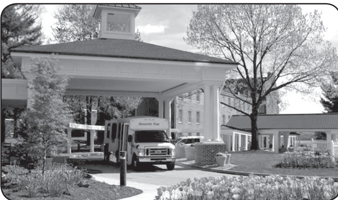
It's a beautiful day in the neighborhood at The Middletown Home!