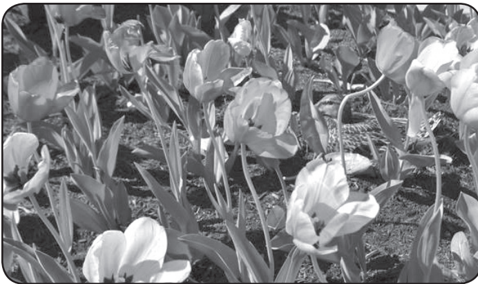
Can you see the momma duck hiding among the flowers on her nest?