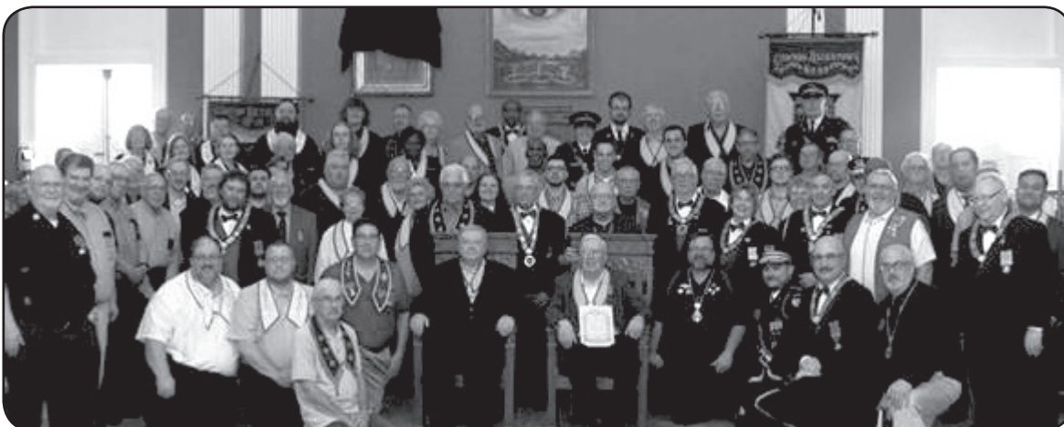
Left: After the Lodge closed, members in attendance crowded together for a group photo.