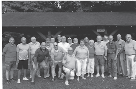
Charleroi Lodge #1030 members and "special" guests.....definitely fellowship at its best!!!!!!