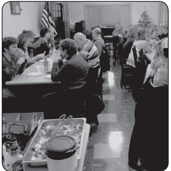
Many and various culinary delights pleasantly pleased the palates of even the most particular diners.