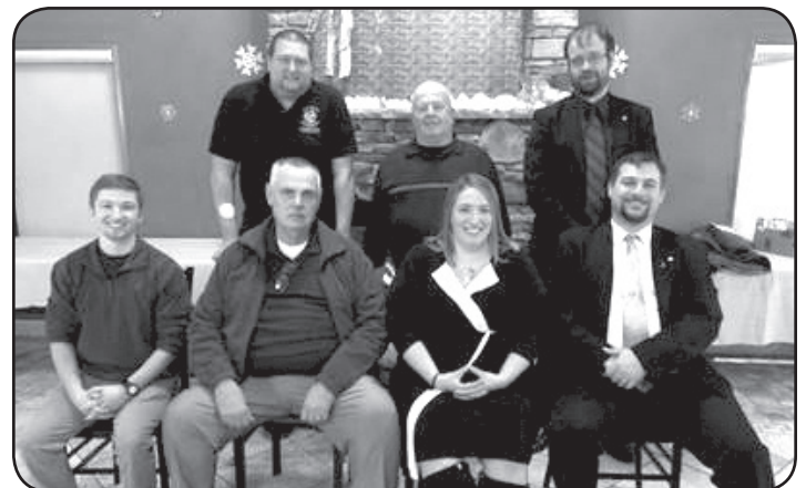
The Officers and Patriarchs of Scott Encampment No. 132, Tamaqua