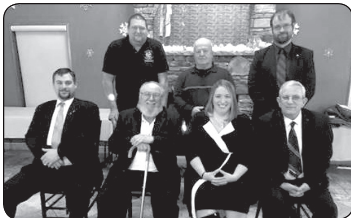
The Officers and Members of Shenandoah Lodge No. 591.

From last month's article, here are two more pictures: