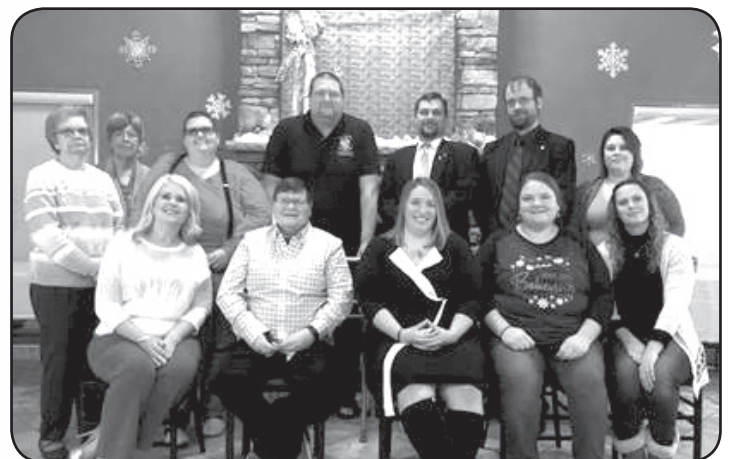
Members of Lady Harmony Rebekah Lodge No. 86 celebrating their 10 th Anniversary