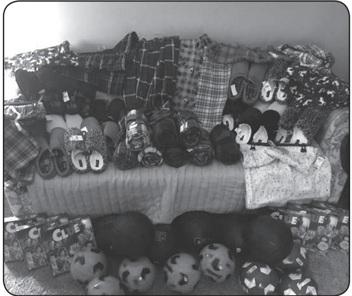
Askam Lodge 899 donates Christmas gifts to local under privileged youth & senior homes.