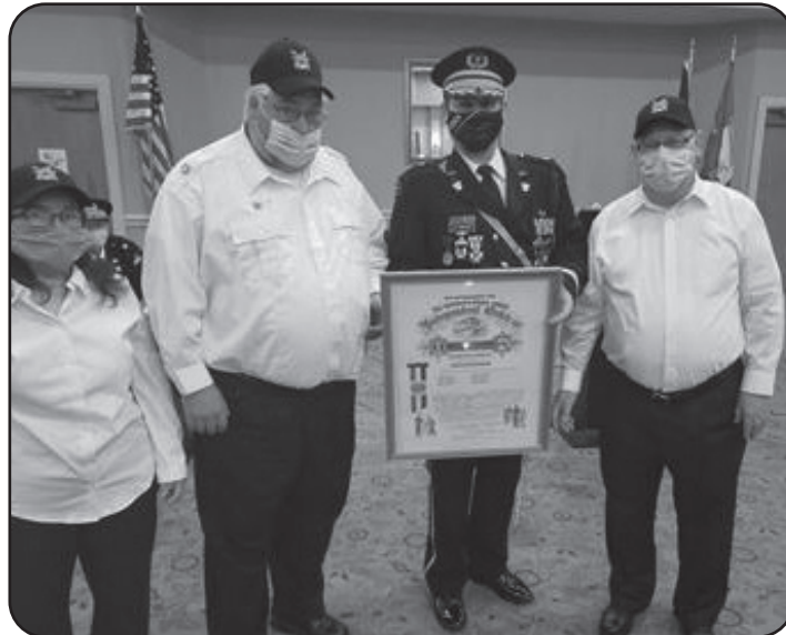
Canton Northeast #9 receives charter ... and more!