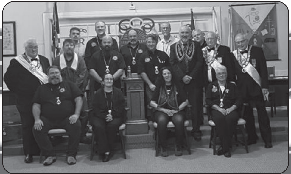
Freedom Lodge Visitation