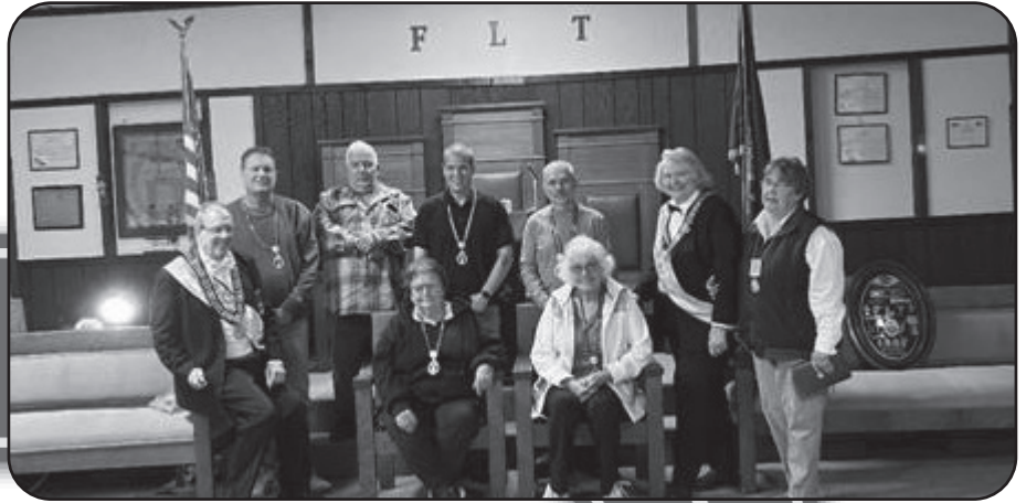
Freeport Lodge Visitation