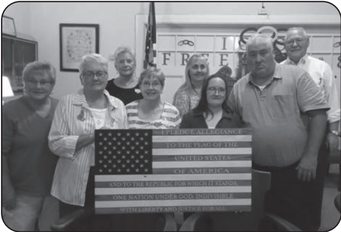
Nakomis Lodge # 497 held Raffle. Grand prize was a wooden American flag donated by Zegers Freedom flags.