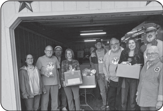
Canawacta Lodge 207 of Hallstead purchased and donated 106 lbs of sausage to the New Milford United Methodist Church.