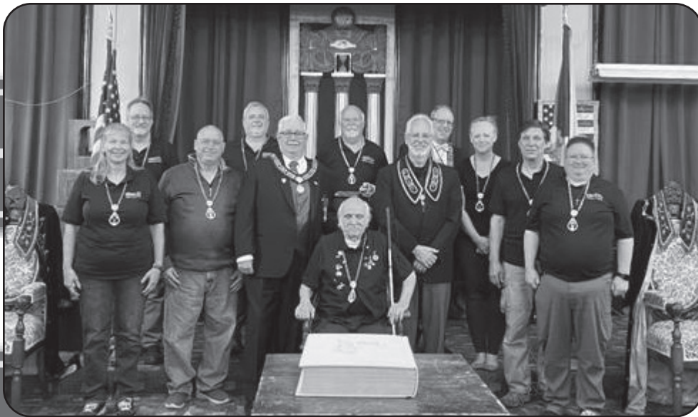
Warren Lodge Visitation