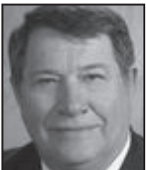
George F. Morrow Unified Lodge No. 2 January 6, 2023

Surviving is one son, one daughter, three grandchildren and three great-grandchildren.