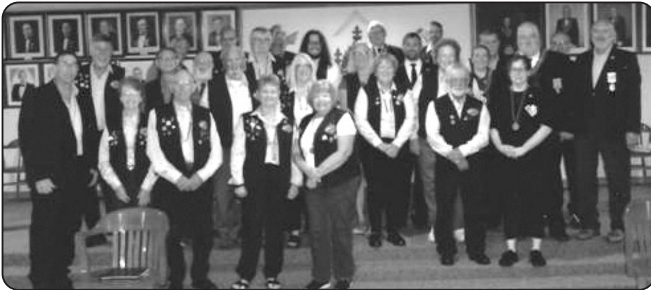
Grand Master Lautenschlager visits Brady Lodge No. 116 of Muncy