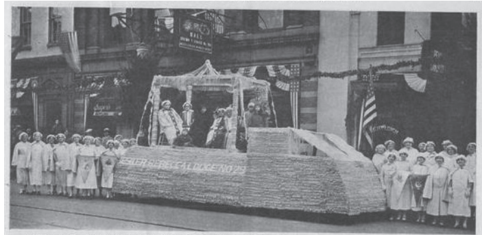
We print above the photograph of the float of Hester Rebekah Lodge, No. 29, which participated in the Centennial Celebration in Tamaqua recently. This float won the Special Prize of $10.00. Other prizes were awarded to the Sunbury Orphanage Band, for coming the greatest distance, and Harmony Lodge, No. 86, for having the largest number in line in the parade.

If you can take a picture of the Lodge Hall that was once in your town and mail it in, we'd be glad to have it for our archives and it could perhaps end up in the magazine!