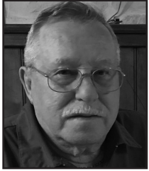
Kenneth G. Knapp Victory Lodge No. 658 September 21, 2024

Due to publication time, we regret we cannot accept Obituaries older than three months.