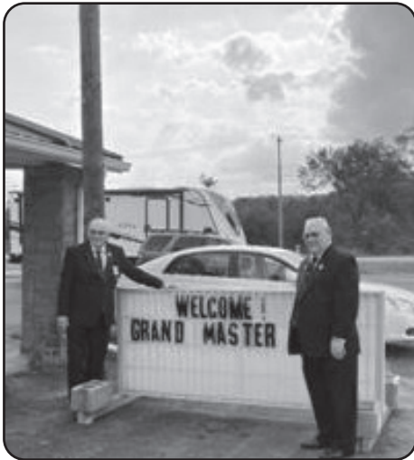
Sandy Lake Lodge No. 573