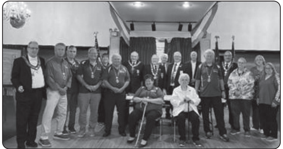
Clover Lodge No. 348, Baden