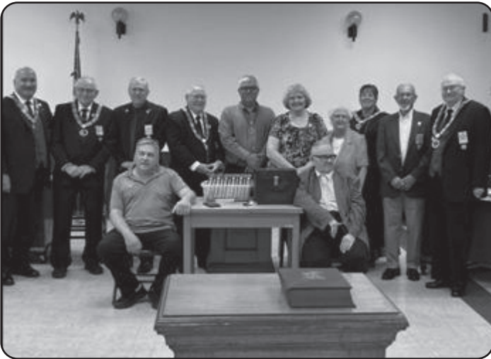
Nucleus Lodge No. 377