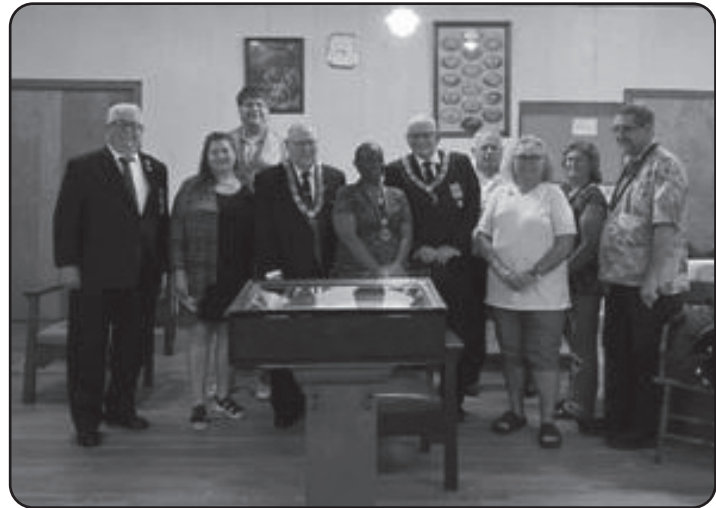
Sandy Lake Lodge No. 573