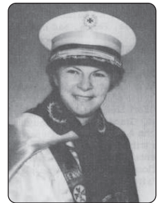
among their I.O.O.F. Brothers and Sisters.