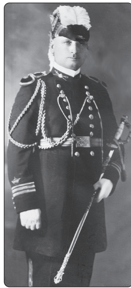
Old style uniform

General Russell Patterson was serving as Department Commander of Pennsylvania when this change took place. He undoubtedly took part in this momentous decision and was tasked with its implementation in our Department. There were two dramatic differences between the old and the new uniform. The first was the hat. Chevaliers originally wore a plumed chapeau style cap. This was replaced by our current Pershing style cap. The look is completely different. The second major change was the length and style of the jacket. It was originally knee length with long rows of buttons up to the collar with no lapel or tie. It had an upright collar and used epaulets. This was replaced by the modern military style uniform coat that we wear today. It is shorter, has lapels and uses fewer buttons. We now wear a tie. The old style uniform did use a Sam Browne style belt as we do today. It was different in that it was made of a patterned fabric (with ornate metal fittings), rather than being made wholly of leather as is our current Sam Browne belt. High ranking officers wore a different belt appearing much like our present day social belt.