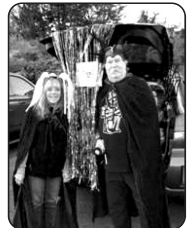
A few of our lodge members represented the Odd Fellows in Spring City's first Trunk and Treat.