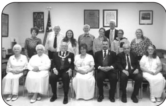
Members of Lady Harmony Rebekah Lodge #86 and Letitia Penn Rebekah Lodge #173 all now part of Lady Harmony Rebekah Lodge #86, with members of the Rebekah Assembly and Lady Colfax Rebekah Lodge #182 of Leesport present.